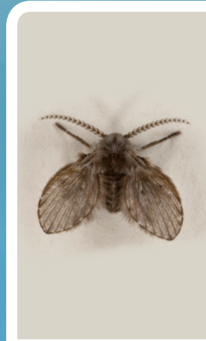
Q 'Psychodinae' family

ECOTHOR ACTIVE NATURE® TURBO ACTIVE: Natural Detergent for Drains cleans and sanitises due to the strong power it exerts on unhealthy biofilms. The eubiotic fragrance is an oil-gel natural product that releases a long-lasting perfume that also contributes to creating an unpleasant environment for biofilms and the associated pests that thrive in these biofilms, such as drain flies.