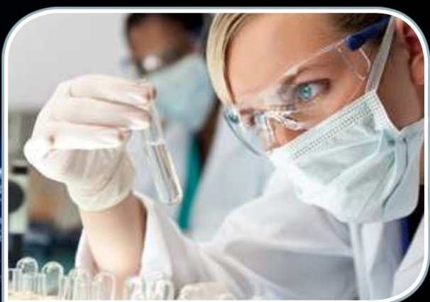
ULTRATHOR has been rigorously assessed by the independent APVMA

Similarly in a Soil Tunnelling study it was proven conclusively that the termites were unable to detect the presence of ULTRATHOR.